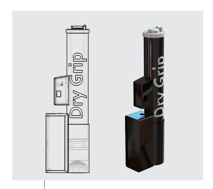
Fab Lab Manchester, owned and operated by the Manufacturing Institute, helps local entrepreneurs develop new product concepts, such as the patented DryGrip portable dryer for removing moisture from golf club grips, developed by local brothers.